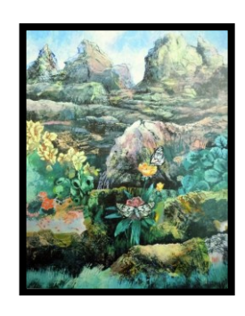
Figure 3: Hamidi Ahmad Basar "Landskap Pergunungan Kinabalu" (1995), Monoprint on wood, 126cm x 98cm, Permenant collection of Shah Alam Gallery, Selangor. The artwork retrieved from Shah Alam Gallery.

Monoprint printing allows considerable freedom in the approach to imagery; this is considered to be a very versatile method. The artist can decide to work positively or negatively, to use water-based or oil based inks like painting and to incorporate other materials or not. Working positively means that the artist will put down imagery with brushes or rollers. Working negatively means that ink is removed with hands, rags, cotton swabs or anything pointed. The directness of painting directly on the plate requires skills of painting as well as a sure hand and a considerable of spontaneity. So far the monoprint has been made with oil bound inks and paints. Although this is most usual and probably most versatile medium, it is possible to make monoprints using water bound inks and paints. Almost any combination of media and processes are possible in mono-printing. The consistency of the materials makes control extremely difficult. Nonetheless, the results produced by such materials can have an exciting visual quality. There are a fluidity and freedom of expression in the monoprint. The lack of technical difficulties allows for a direct approach similar to that in painting.