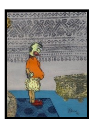
Figure 10: Azizan Paiman "Dhobi" (1997), Monoprint, 20.5cm x 15cm, Artist's collection. The artwork retrieved from artist's collection by Azizan Paiman.

A transfer image from drawing or painting is produced by placing a sheet of paper on an evenly inked surface. A metal plate, a lithographic stone, a piece of hardboard or any smooth surface is suitable. The design is the drawn on the sheet of paper with whatever instrument or combination of implements is preferred. A pencil, ball point pen or wooden end of a brush is all possible, and obviously, a