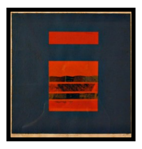
Figure 8: Tajudin Ismail "From The Window" (1974), Monoprint, 47cm x 47cm, Permenant Collection of National Visual Art Gallery, Kuala Lumpur.

A monoprint is one of printmaking technique where by design is drawn onto a flat non-porous surface, also referred to as a printing plate. Paper is laid on top, and after pressing, the design from the plate is transferred onto the paper. It involves painting images onto the printing plate, laying the paper on top, and pressing to transfer the images onto the paper. For the second method, it can be a subtractive technique in that you cover the entire surface or a large area of the printing plate with paint. Images are created by "removing" paint from the plate using a cotton swab or your finger and transfer to the flat surface. Virtually any surface which is flat and preferably non-absorbent maybe used a printing plate or block. It is not essential for the plate or block to be smooth. Print may be taken by textured wallpaper or the reverse side of a sheet of hardboard but is more usual for the plate to be without indentations. The most common materials used as printing plate are lithographic stones, copper or zinc printing plate and glass. Glass has the advantage of being transparent so that a drawing may be placed beneath it and used as key or guide. They are however many other surfaces which are suitable for example plywood, hardboard, blackboard, ceramic tile, slate, linoleum, canvas, cardboard and paper.