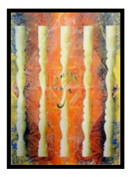
Figure 13: Zarinah Mashudi "Ar-Rahman" (1994), Monoprint on paper, 105cm x 82cm, a permanent collection of Tuanku Nur Zahirah Gallery, Shah Alam.

A monoprint is part of the technique that well established in printmaking. The monoprint is means of producing a single output or print. It is different with others printmaking medium such as etching, engraving, lithography, relief print and