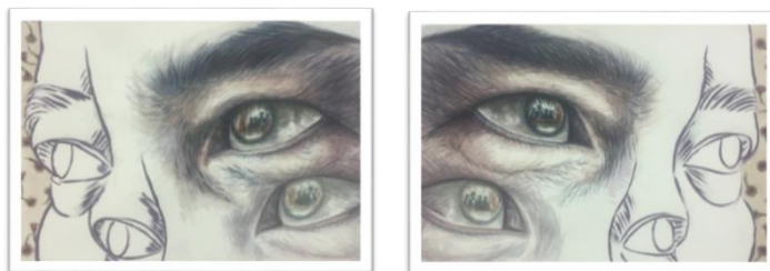
Fig. 2 The left and right of Mom, 4 x 3 feet, Watercolour on paper, 2018

I could say that my trademark in my artworks has lines to shows the overlapping layer but for this artwork it does show the lines but not stand as overlapping technique. Plus, for this artwork there is a pattern at the