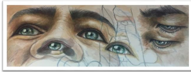
Fig. 1 Mom's Complexity Emotion, 6.3 x 2.9 feet, Watercolour on paper, 2018 The title for the artwork above is 'Mom's Complexity Emotion'. I used Artist Alpha watercolour as my medium on the watercolour paper. The size of the artworks is 6.3 x 2.9 feet and it was made in the year 2018. Generally, the artwork shows women's facial expression whom my mother and performed in a rectangle format. For this artwork, I used a landscape shaped of canvas.

The artworks established the foreground and background. The background can be seen on the overlapping layer at the back. Meanwhile, the solid form of the portraiture can called as foreground. Plus, the foreground can be stated at the colourless part of the artwork. The arrangement of the artwork is very symmetrical by looking at the stability of the colour. Even though, the form of facial expression has done as unfinished artwork. But, somehow it is completed my desire achievement. The shape of the artwork obviously can be proven at the eyes which purposely focus on the eyes. The lines that leave the artwork unfinished has create the balance and success by not completing it. Well, maybe the colours used very nude, dull and pastel but to sum up it works the unity popped up well. The idea that I hold is the same as I mentioned before again and again. 'Mom's Complexity Emotion' as the title and I agree if anyone say the facial is faceless but in my point of view the faceless face does contains a lot of unforeseen fear, anxiety, depression and sadness deep in her heart through her eyes. That is why I loved to played with my mother's eyes because I could sense and read the eyes as I am her daughter.