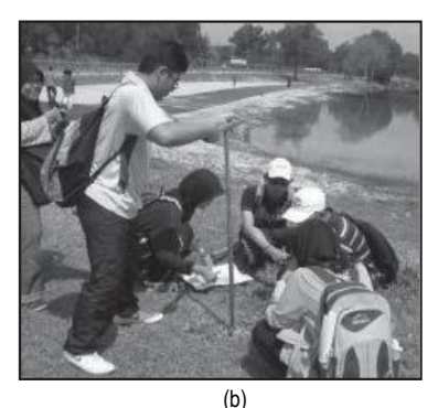
Figure 1: (a) Brainstorming Session before the Design Stages; (b) Soil Structure Test made by Civil Engineers

The concept plan and master plan must have green technology and sustainability elements. Sustainability needs to be at the heart of everything we do. This leads to a high priority to green technology development and at the same time it will educate the people