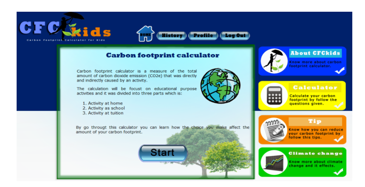
Figure 2: Main Page for CFCkids

The interface for CFCkids was constructed based on the design principle guideline for children. The interactive web of CFCkids application was designed and developed by applying images and animation and has less text to cater to the needs of children who has less interest to learn about a complex issue such as climate change. Figure 2 shows the main page of CFCkids web application.