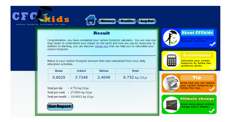
Figure 3: Result Page

After all necessary information has been included, the result page of carbon footprint will appear after the user clicks the "Result" button. This page it will display the total amount of carbon footprint based on kids' daily activities for educational purposes that contribute to the emission of carbon dioxide. Besides that, users can also view weekly and monthly total amount of carbon footprint (Figure 3).