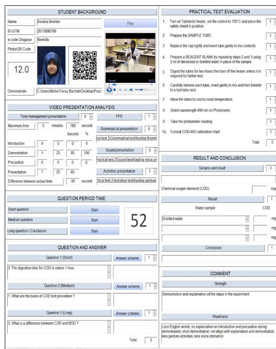
Fig. 2: Interface of the whole e-PraTeSiM system