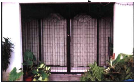
Figure 1: Safety grille for sliding door.

In order of safety, almost every house in all housing estates does have a safety grille (see figure 1) for their doors and windows for safety precaution but criminals still can easily enter the premises. Furthermore, an extra padlock (see figure 2) had been considered as a preventative action in order to have anti-breaking safety grilles.