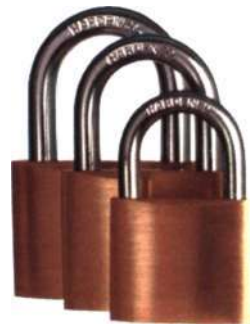
Figure 2: Stainless steel padlock.

In this modern world, some people can afford to have an alarm system in their house but unfortunately robberies still happen and break-in are still the main issue in every housing estates in our own country (see figure 3).