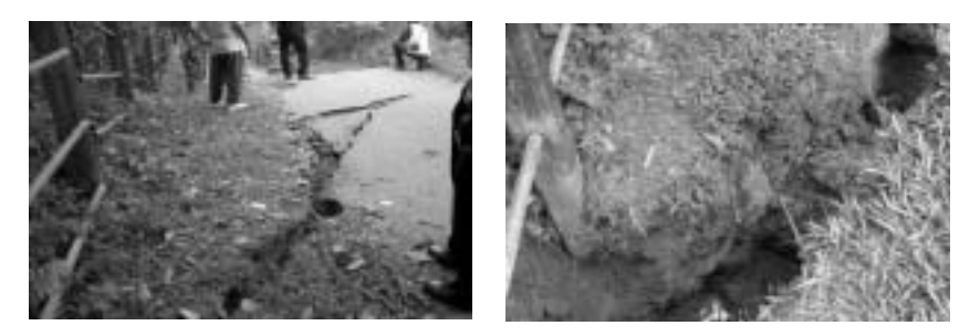
Figure 2: The development of tension crack at the crest of slope surface in which the present of rainwater will expedite the potential slope failure. Picture was taken at Wangsa Maju, Kuala Lumpur