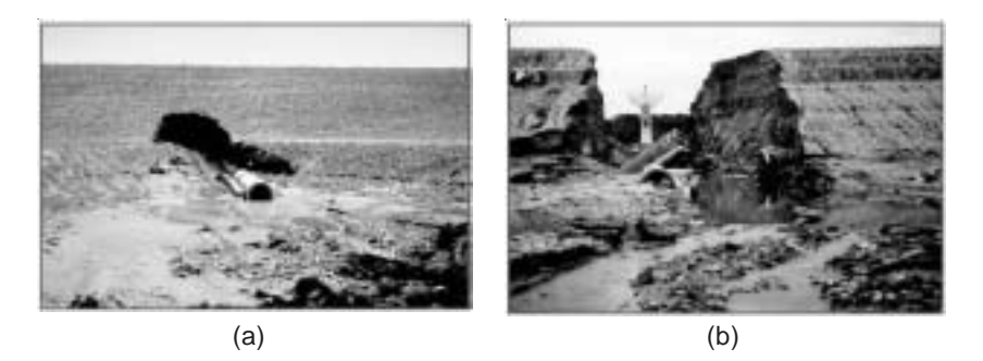
Figure 1: A failure due to internal erosion which leaves a huge void space along the conduit and embankment failure due to discontinuity represented by the conduit.