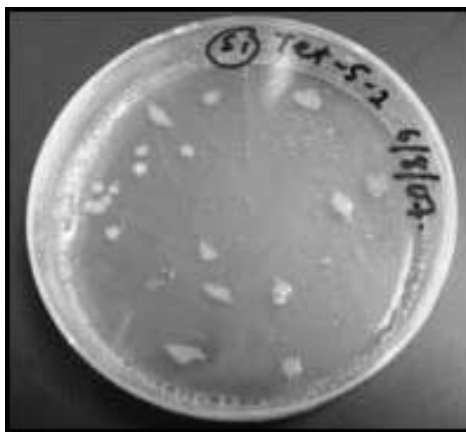
Figure 1: Example of an Obtained Colony

On hydrocarbon-coated agar plates, clear yellowish, brownish or cream-colored zones appear indicating formation of bacterial colonies and hydrocarbon degradation. Serial dilution in the range of 10 to 10 is made for each colony to decrease the intensity of microbes for each streaking. By decreasing the intensity of microbes in streaking technique, better purification process is obtained. A total of 53 purified strains is obtained and labeled. Figure 1 illustrates an example of an obtained colony.